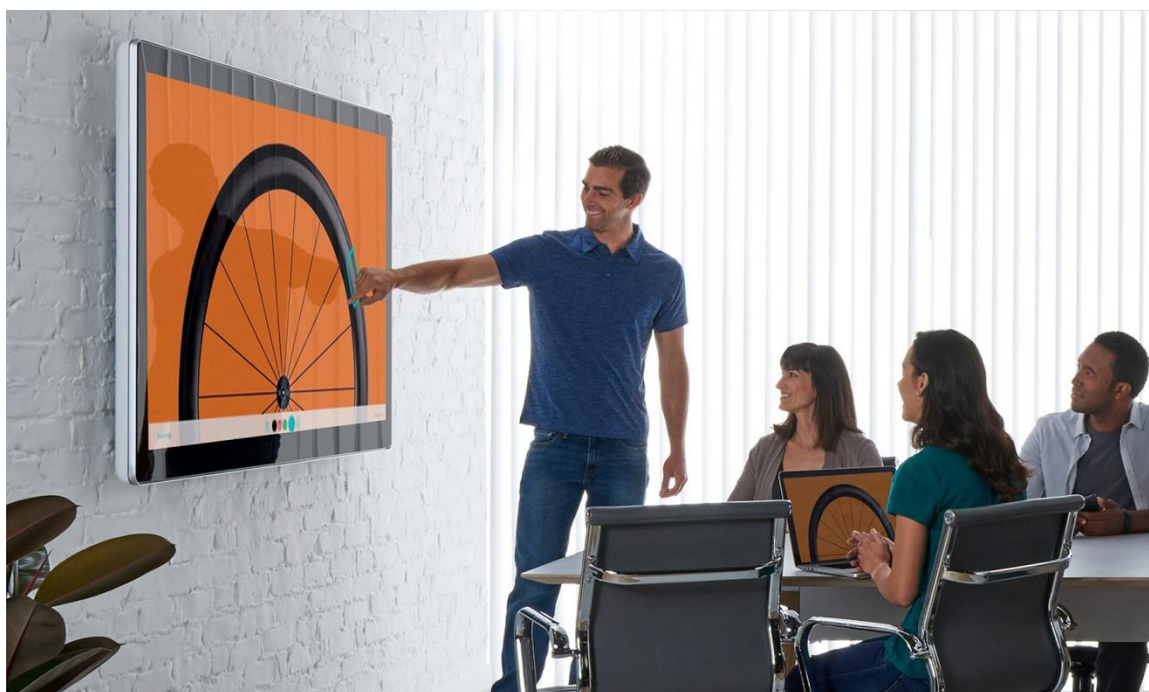
Figure 1. White Boarding Capability on the Cisco Spark Board 70

The Cisco Spark™ Board is an all-in-one device that provides everything you need to collaborate with your teams in physical meeting rooms. You can wirelessly present, white board, and have video and audio calls. And it securely connects to your virtual teams through the Cisco Spark service, via your Cisco Spark app-enabled devices, so you can take your meetings and content on the road.