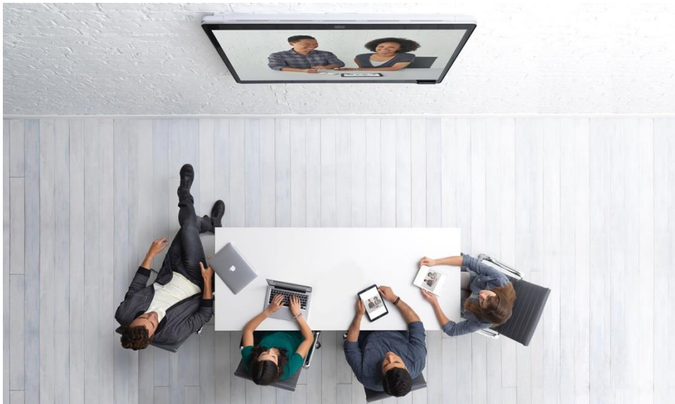
Figure 2. Video Conferencing on the Cisco Spark Board

The Cisco Spark Board is the latest addition to the portfolio of Cisco Spark video and audio conferencing devices that register to the Cisco Collaboration Cloud, including the Cisco TelePresence® MX and SX Series, the Cisco DX Series, the Cisco IP Phone 7800 and 8800 Series, and the Cisco Spark Room Kit Series .